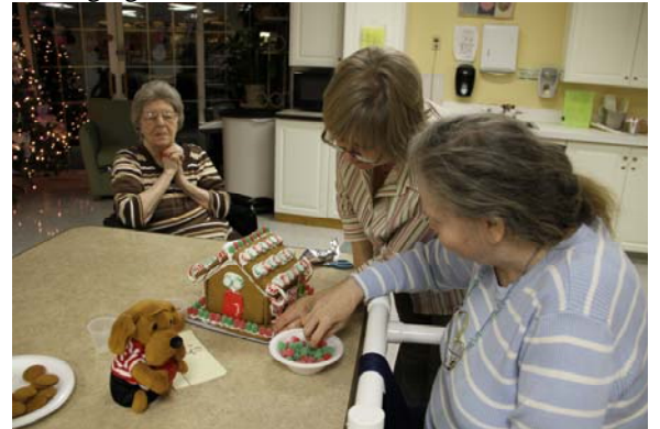
Many residents enjoyed decorating the house.